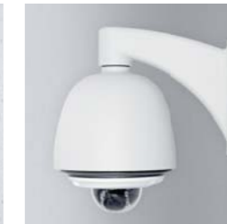
Gooseneck Wall Mount