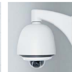
Gooseneck Wall Mount